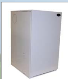
Ambassador Condensing Kitchen